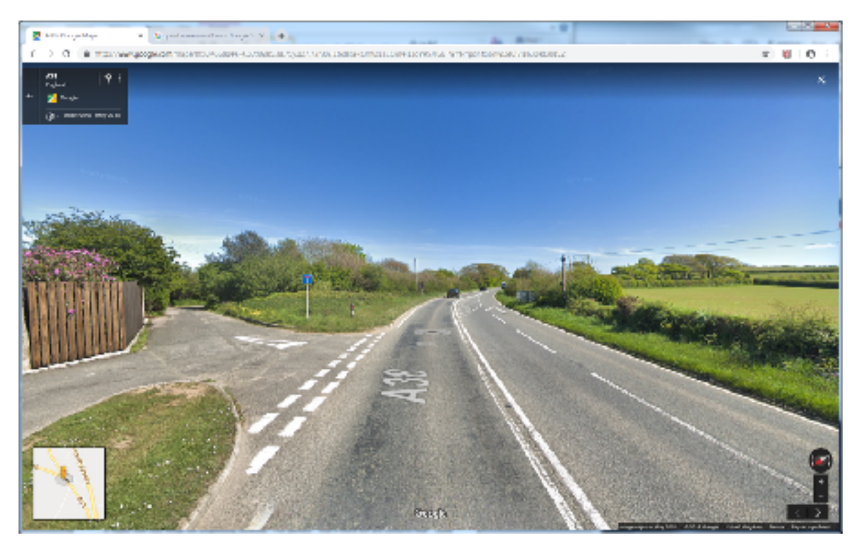
1st turn-left (Carminnow Cross) SP Plymouth/Liskeard