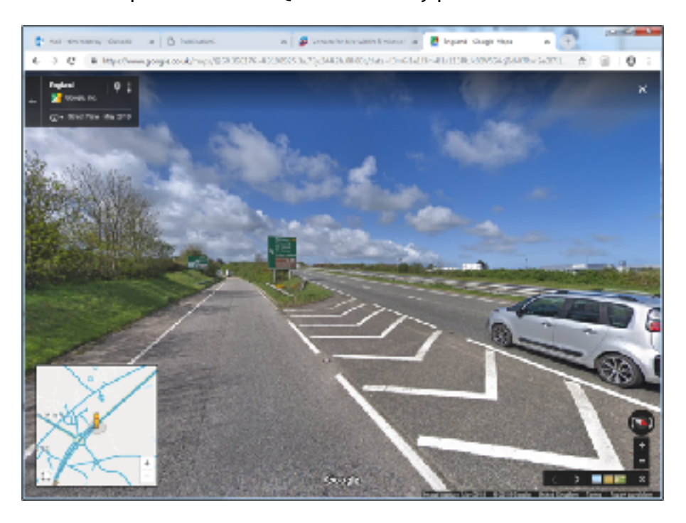
Roundabout at end of sliproad, take 5^{th} exit (to return along A30)